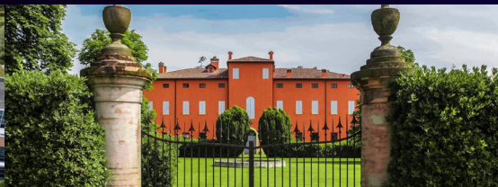
Villa Forni Strada Piradello 106, 41126, Cognento (MO)

The 20 TH June from 7 PM stay with us for JD Aperitif