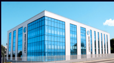
JDentalCare Training Center Via Dino Campana 2, 41123, Modena