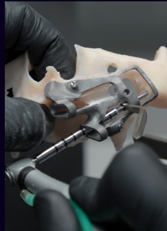
HANDS-ON Z-GO GUIDE™