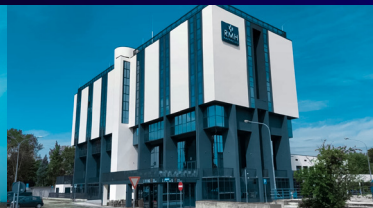
RMH Modena Raffaello Hotel Strada Cognento 5, 41126, Modena