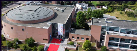
Forum Monzani Centro Congressi Via Aristotele 33, 41126, Modena

The 20 TH June from 7 PM stay with us for JD Aperitif