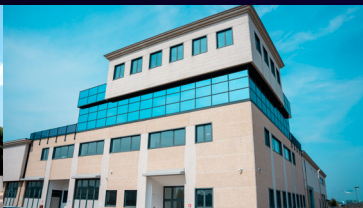
JD Milling Center Via Guido Cavani 69, 41123, Modena